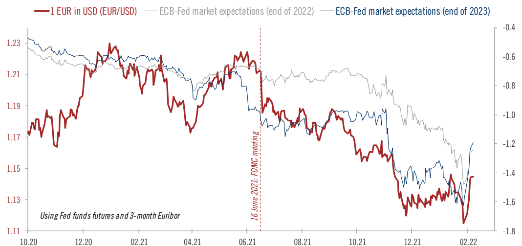
CHART 1: EUR/USD VS. MARKET EXPECTATIONS FOR THE DIFFERENTIAL BETWEEN FED &amp; ECB POLICY RATES

We have long argued that short-term interest rate differentials are a key medium-term driver in the EUR/USD exchange rate. Since the Fed's hawkish pivot in June last year, this driver has been a constant drag on the single currency versus the greenback, especially in the last two months of 2021. But the more hawkish tone adopted by the European Central Bank (ECB) at its Governing Council meeting in February suggests this differential has bottomed and may even rise in the course of the year, thus helping the euro ( see chart 1 ).