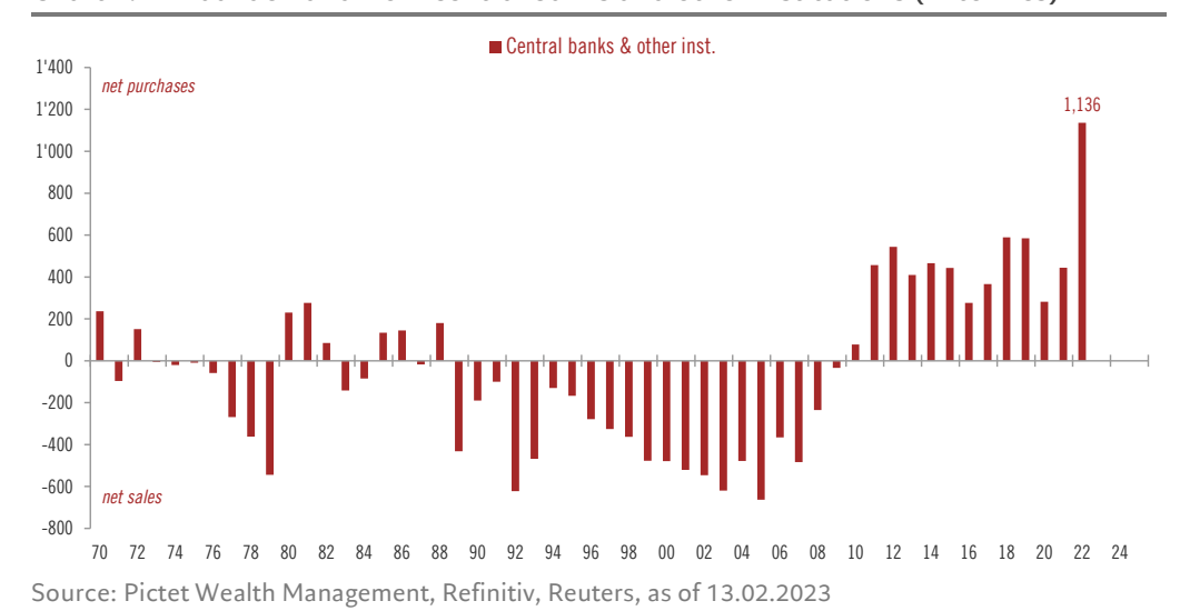
Chart 1: Annual demand from central banks and other institutions (in tonnes)

For illustrative purposes. Past performance should not be taken as a guide to or guarantee of future performance. Performances and returns may increase or decrease as a result of currency fluctuations. There can be no assurance that these projections, forecasts or expected returns will be achieved. The projection is not based on simulated past performance.