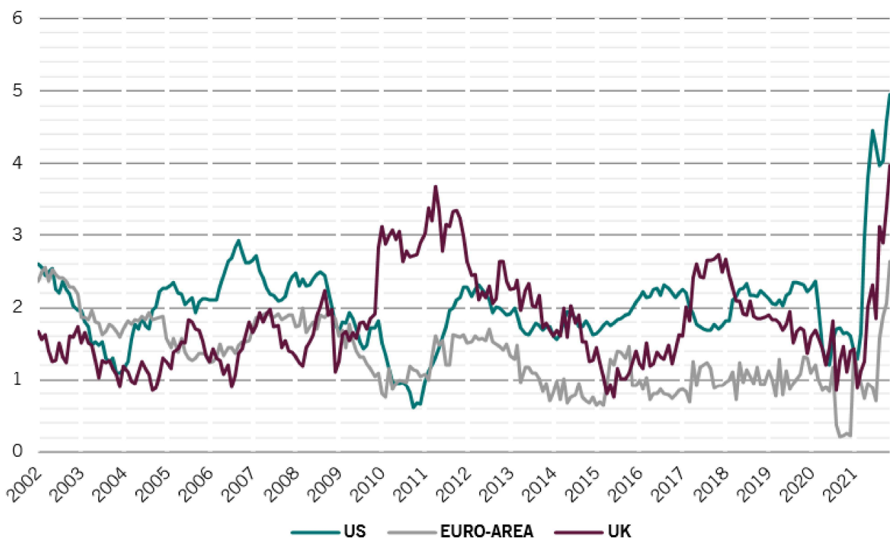
Fig. 2 - Inflation: a global problem US, euro zone and UK core CPI