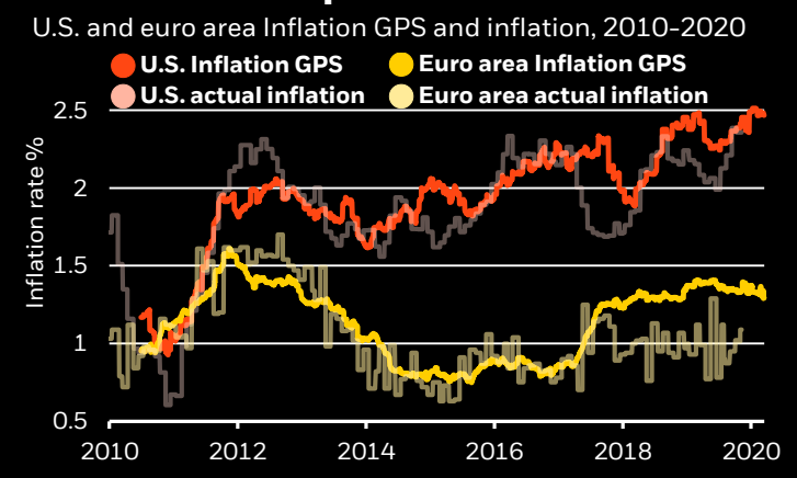
Sources: BlackRock Investment Institute and Refinitiv Datastream, November 2019. Notes: The U.S. Inflation GPS shows where core (excluding food and energy) consumer price inflation (CPI) may stand in six months' time. The Euro area Inflation GPS shows where the core harmonized index of consumer prices (HICP) inflation may stand in six months' time. The faded lines show actual U.S. core CPI and actual core euro area HICP inflation. Forward-looking estimates may not come to pass.